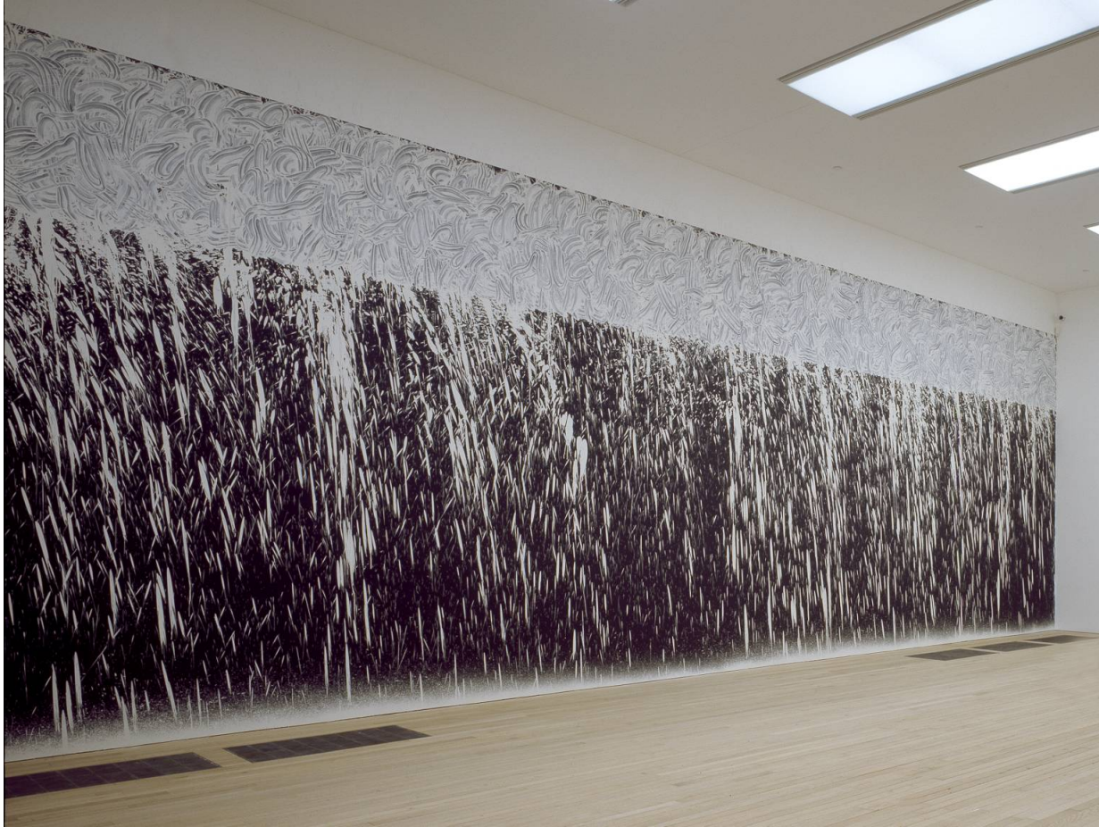
Figure 7: Richard Long, Waterfall Line , 2000.