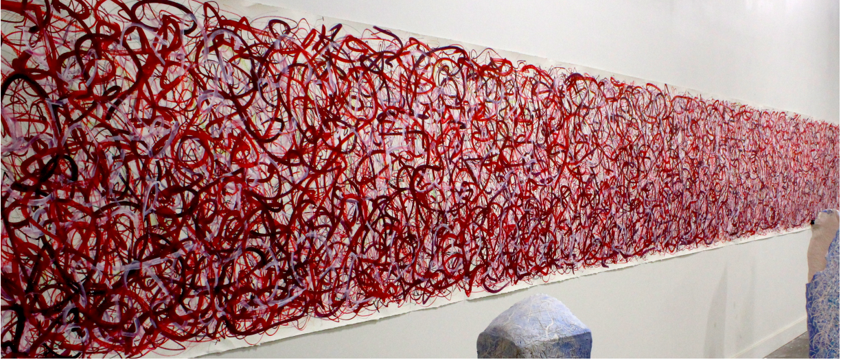
Figure 2: Untitled1 2018

It is imperative for me to control mental and physical aspects of all artwork's production. These aspects can be practiced and carried out as compartmentalized units in order to control the collective whole of the art making experience. Drawing from my past experience in meditation, strength and endurance training, and combative I can control my position to govern the form and design of the materials. The association with mental rehearsal in order to win a wrestling match, the deliberate change of practice to improve skills and physical condition, and the awareness of one's body, all play a role in attaining originality in my artistic process. Similar to conditioning the body in wrestling where certain movements become reflexive and responsive, the critical eye and hand of the maker can also be trained to reflexively manipulate material and create subject matter for artwork. Established art systems and past processes are the foundation that we as artists use to progress. I see that the human body and mind must be controlled in order to determine the trajectory of displayed objects. Personalities and tendencies guide artists toward the most suitable methods and materials.