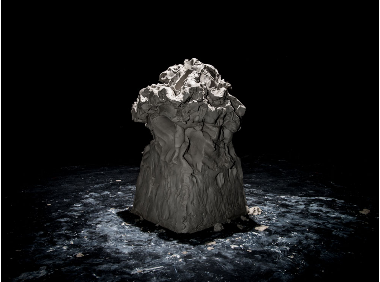
Figure 5: Heather Cassils, Reliance of 20% , 2012.

In Heather Cassils' piece "Reliance of the 20%", (Figure) the display of extreme exertion through boxing on a monolithic mound of clay corresponds directly to my personal application of energy against the material. The human impressions made on the material form recordings of direct engagement as shock is sent through the entire mass. The shifting of material through physical impact and the relationship between force and opposition directly correlate to my conceptual ideology. This is the act of art making purposefully placed bodily movements utilized for a medium to be acted upon. Cassils' use of clay as a vehicle, acts not only as a way to display a recording of force or will, but also speaks to the transcendence of material through