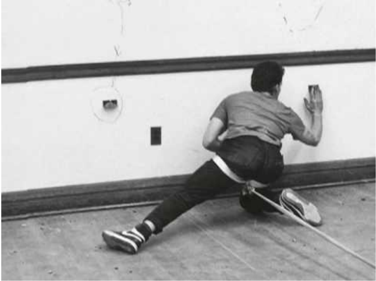
Figure 9: Matthew Barney, Drawing Restraint , 2007.