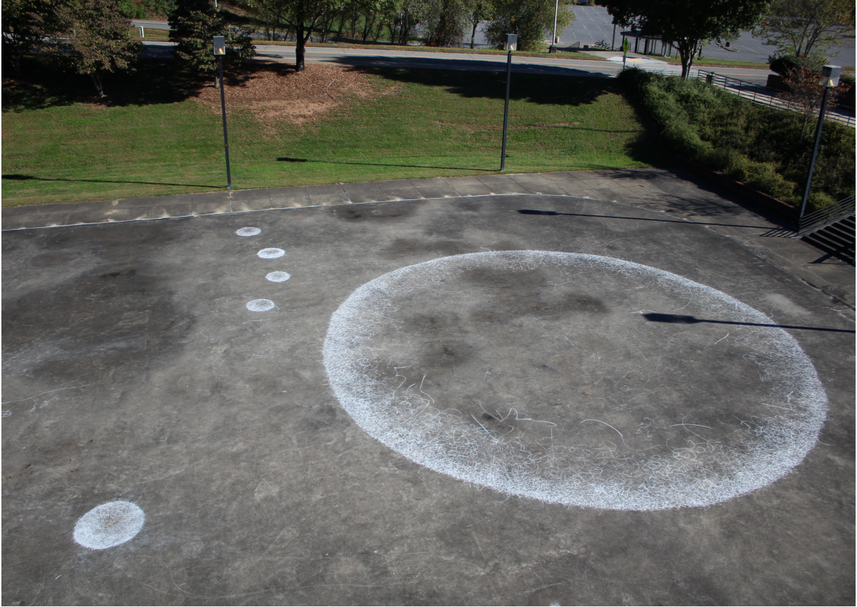
Figure 3: Untitled1 2017