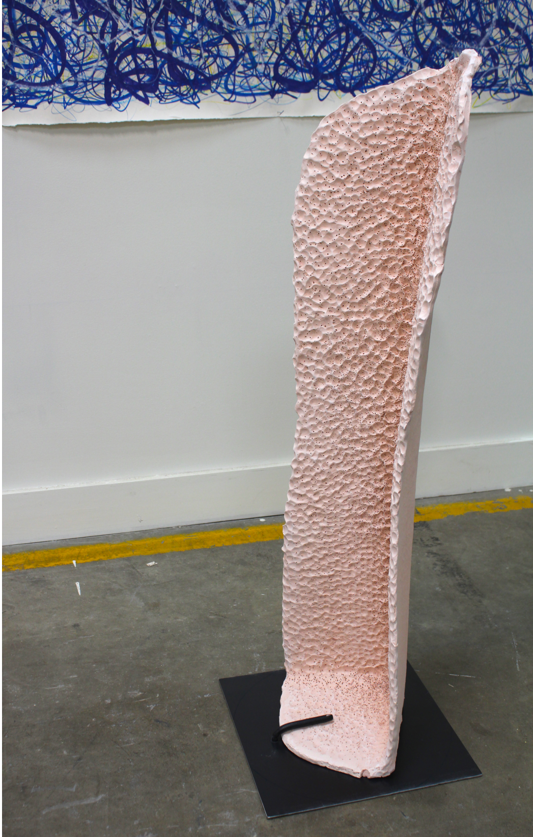
Figure 4: Untitled 2, 2018