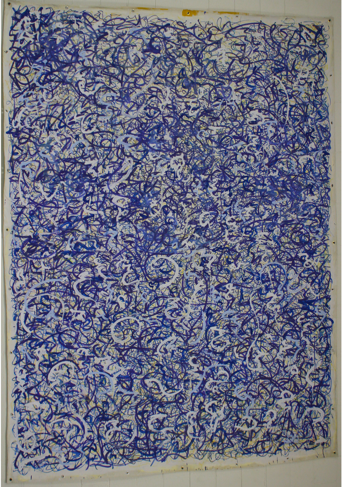
Figure 10. Untitled 3 2018