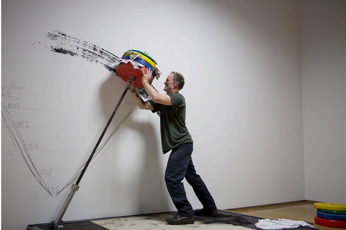
Figure 1: Matthew Barney, Drawing Restraint 20 , 2013.