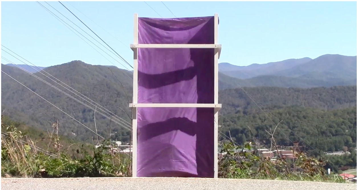
(fig. 2: still from video performance, “No Hunting Purple Paint”. the specific color purple paint legally indicates a no hunting/trespassing/fishing zone in participating states... or does it?)

As I explore the objects + forms we use to make up our environments, the objects + forms take on their own experiences. I imagine them to be almost-animated, invoking the absurd. As we utilize these objects as tools for boundary making, it further reveals their absurdity and the ephemeral nature of our environments. Through this process, I have started to reflect on my own environments and desires for these boundaries and the moments i indulge in them breaking down or dissipating. The spaces we make to welcome this danger to exist, in an imagined realm, allows us to reflect on the pitfalls of society in a somewhat digestible way. The argument of whether fear is valid or not is irrelevant here, as everyone's own emotions are valid in their own rights. Instead, I am interested in poking at the bruises on these tools we rely on to decide what is dangerous and what can protect us (fig. 2).