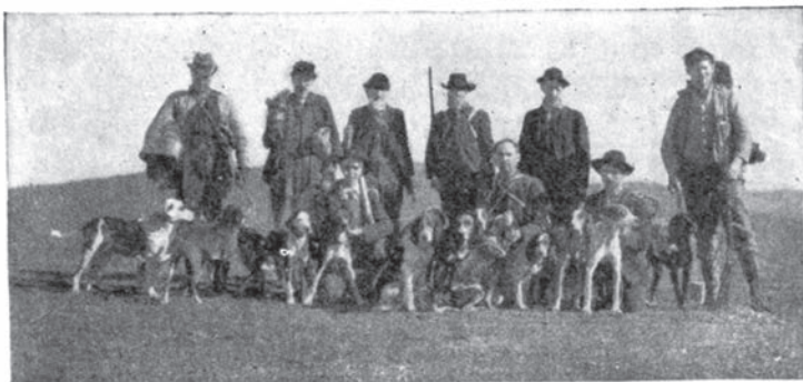
Waynesville Hunting Club on Top Smoky Mountains