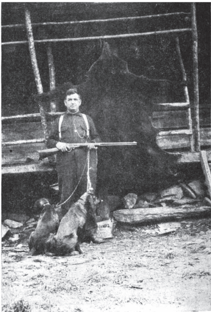
Portwood and Black Bear Hide