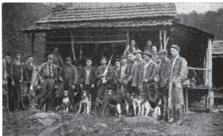
Bryson City, N. C., Hunting Club at Bryson Cabin

back to me. I kept climbing the hill toward the dogs and Old Riley kept close to me. He would look to one side and then the other as though he was trying to see what was in front of me. By this time the bear and the dogs had crossed Bear Pen Ridge and had gone pretty close to where Cub was standing. They went over Bear Pen Ridge to the head of Big Branch and treed. When I got to the top of the ridge Old Cap and Jolly were giving the tree bark. I went on toward the tree as fast as I could and Old Riley kept up with