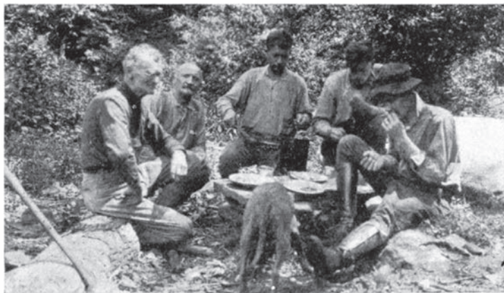
Fishing Party on Little River

Next morning we packed and got ready to go home. We hired Dodson to help pack our game; we were loaded with bear meat, deer and coons; every man had a good pack load, besides the horse was loaded heavily; we came down across Slick Rock Creek, across on to Bear Creek, to Davie Orr's that night and stayed all night with him. We had a good, jolly night, and there we divided up and separated from our hunt.