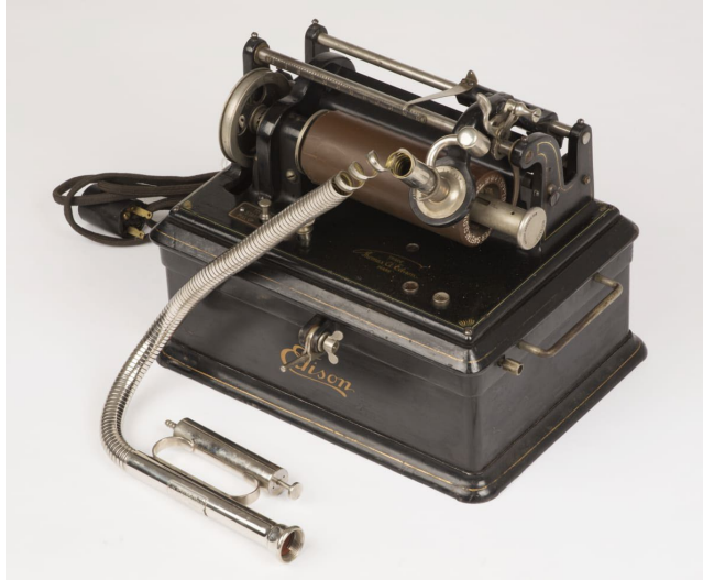
An Ediphone Dictation device from the Collections of the Henry Ford Museum of American Innovation.

THF157848 / Ediphone, Model E, 1912-1914