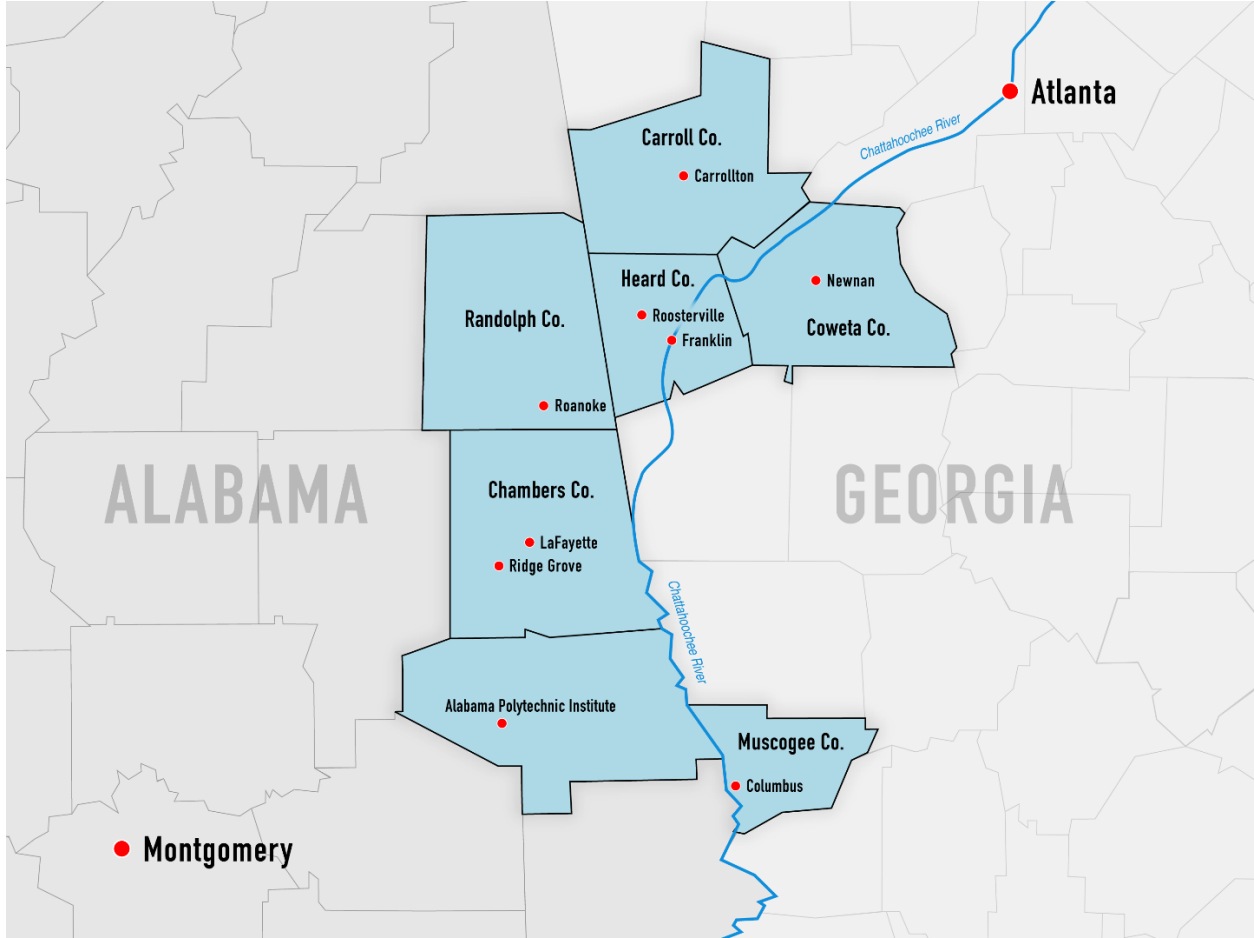
Map of West Georgia and West Alabama