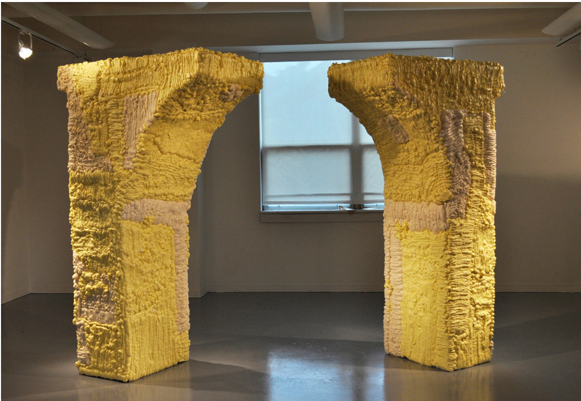
Fig. 4, Wedge Left and Wedge Right , Amy M. Anderson, 2012. Sculpture.

own independent entity, Wedge Left and Wedge Right . Made of hollow corrugated plastic and cardboard then covered in spray foam, the structures reference reality but are indeed just objects on the stage. The tangible structures are free-standing forms there to enable our act but cannot support anything real.