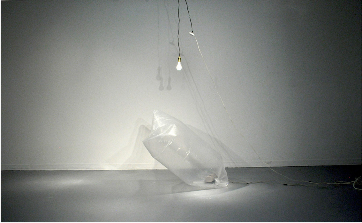
Fig. 7, breathing machine, Amy M. Anderson, 2013. Sculpture. Video Still. 56 second Digital Video.