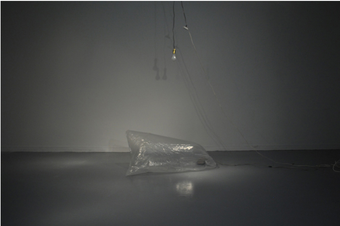
Fig. 6, breathing machine, Amy M. Anderson, 2013. Sculpture. Video Still. 1:24 second Digital Video.

Through the use of everyday objects and easily recognizable materials, viewers are invited to consider each work, its components and the meaning given to the piece by the intentional combination of these objects and their new functions.