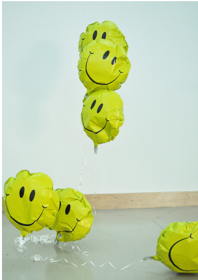
Fig. 1, Midlife Crises , Amy M. Anderson, 2015. Sculpture

The balloon series confronts the same issue of mortality. Take Midlife Crises for example (figure 1). The smiling balloons are gathered around in a group, each at different phases of shelf-life – not completely deflated but fully realizing they are no longer full of helium and the day will come when they will have no helium left.